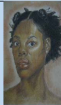
Medium: Sepia Crayons