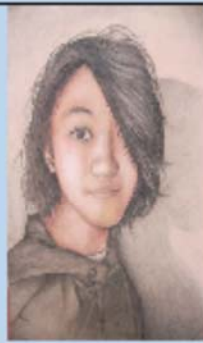
Medium: Sepia Crayons